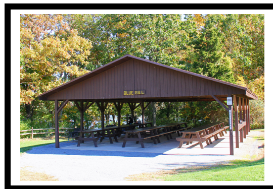
Blue Gill Pavilion