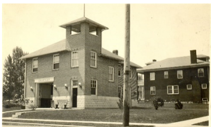
Grantley engine house on Virginia Avenue in Spring Garden Township.

In 1926 the Grantley Fire Company is organized and begins construction of their engine house. Work began in August, but the building was not completed until early in 1927. I could not find any information on who might have been the architect of that station. It almost certainly has to be based on the Victory engine house, as the only visible difference between the two is the size of several windows, and the location and design of the chimneys.