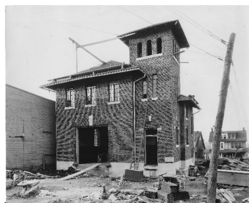
Harrisburg’s Pleasant View engine house under construction.

I’ve left it up to Dave to try to tie in the Pleasant View engine house with the York engine houses.