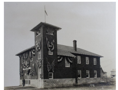
First Victory engine house on Mount Rose Avenue in Spring Garden Township.