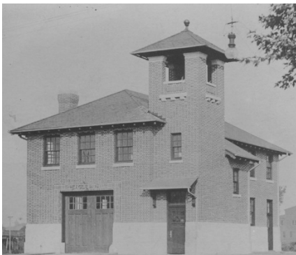
Eagle engine house on West Jackson Street in York City.

The Eagle engine house is the oldest of the three. Ground was broken by the City of York for the Eagle engine house on June 13, 1912. Hamme & Leber, a prominent York architectural firm at the time, were the architects.